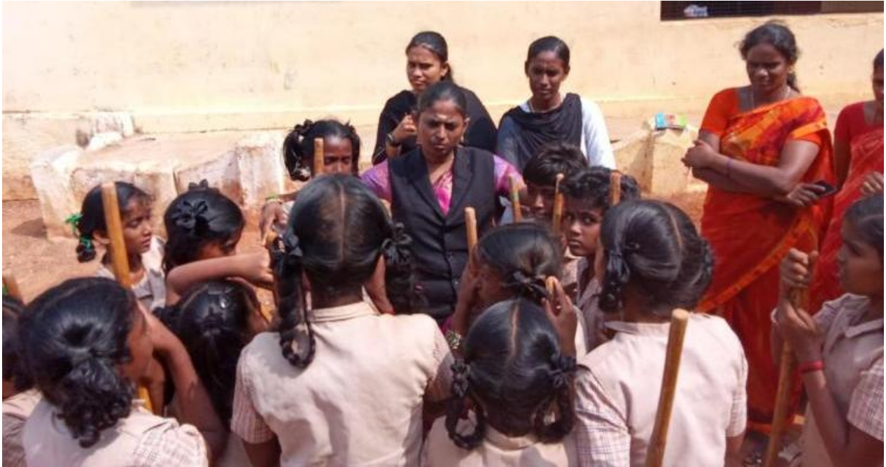
Hon. DLSA Secretary Interacting with Students of RSTC